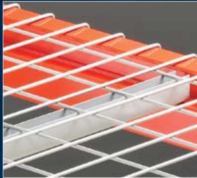
STANDARD U-CHANNEL Waterfall design with standard U-channel to fit common step beams