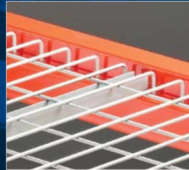
INSIDE WATERFALL Inside waterfall leaves beam face unobstructed for labels and barcodes