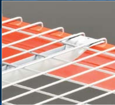
FLARED CHANNEL Waterfall design with flared channel for box or structural beams