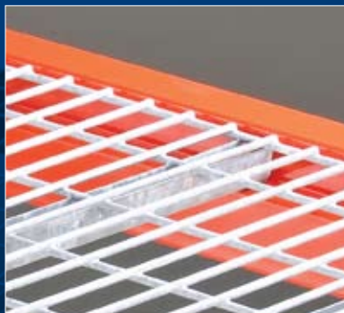
FLAT FLUSH Designed for hand stacked loads and order picking; fits inside load beams.