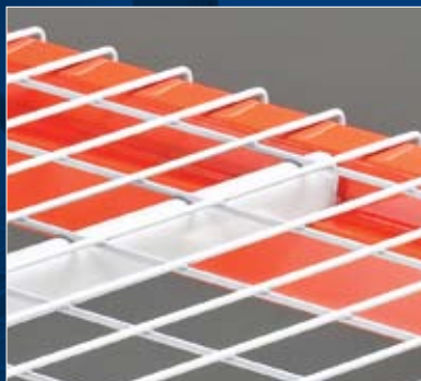
INVERTED CHANNELS Designed to prevent collection of dust and debris inside the channel